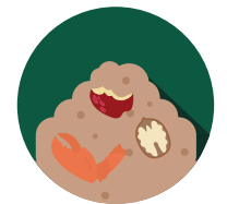
Walnut shells, crab shells, and more!

Even biosolids, compost, and food scraps are being repurposed for good!